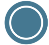
NETx BMS Server

NETx BMS Server is more than a simple data server - it's a full building management solution.